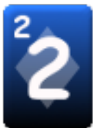
card_2d.png - Deuce of Diamonds

The “mini” deck is used for cards displayed within reports and is the default option within the Hand Formatter. Each card is saved using the format mini_Xs.png where ‘X’ = the card face (Ace through King) and ‘s’ = the card suit (h,d,s,c which represents Hearts, Diamonds, Spades, and Clubs respectively) as shown in the samples below. The recommended dimensions for each card is 14x18 pixels