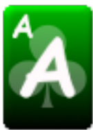
card_Ac.png - Ace of Clubs

The “Normal” deck is used for cards shown within both of the PokerTracker 4 Replayers, and optionally they may also be used within the Hand Formatter. Each card is saved using the format card_Xs.png where ‘X’ = the card face (Ace through King) and ‘s’ = the card suit (h,d,s,c which represents Hearts, Diamonds, Spades, and Clubs respectively) as shown in the samples below. The recommended dimensions for each card is 50x70 pixels, please verify compatibility in the Replayers and the Hand Formatter when using alternative dimensions.